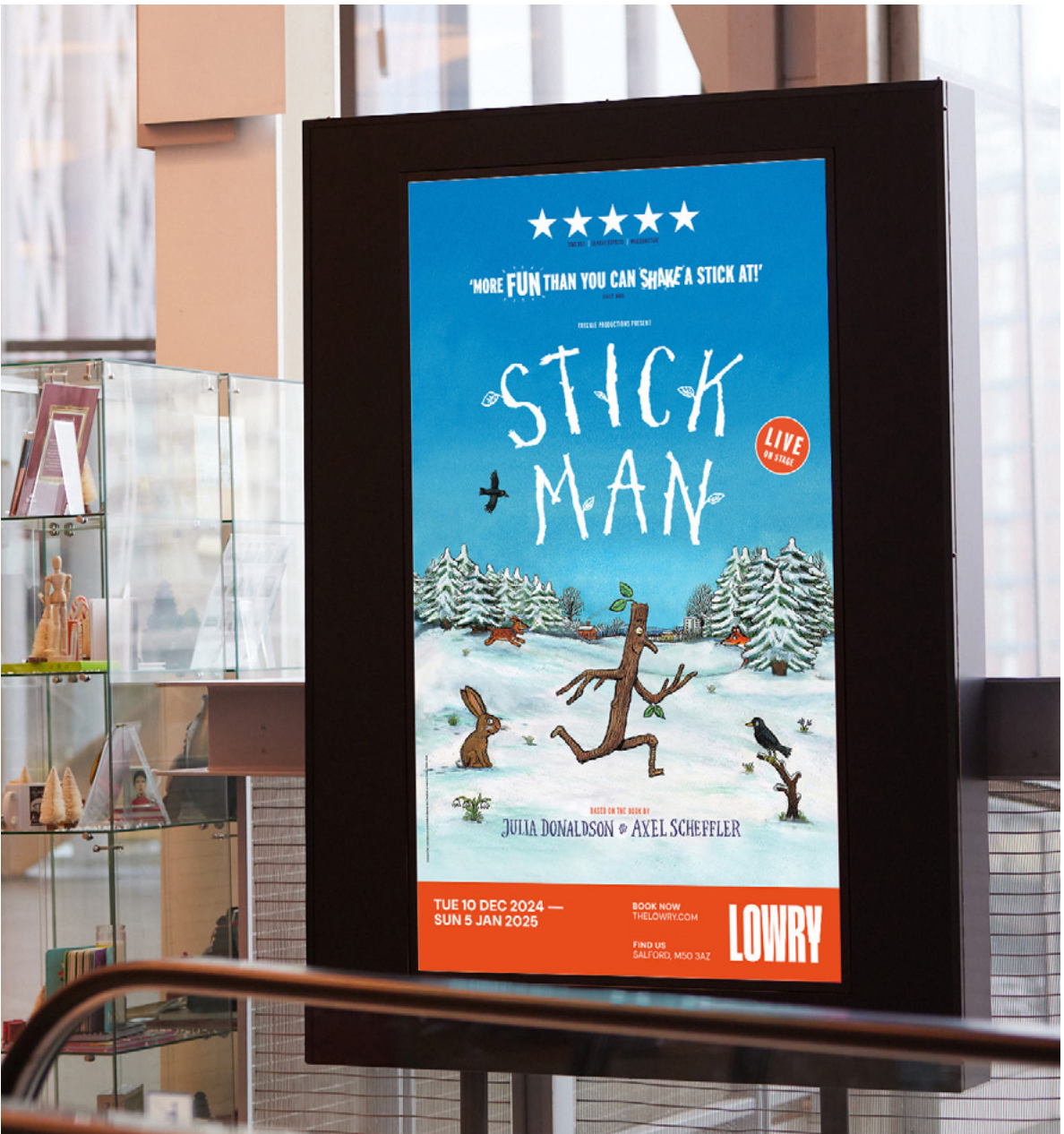
IMAGE 1080px (w) x 1920px (h). JPEG / PNG / GIF. Max file size 1MB.

VIDEO/MOVING IMAGE MP4 for Video. Maximum 30 seconds. These can be displayed immediately and updated closer to the show date if required.