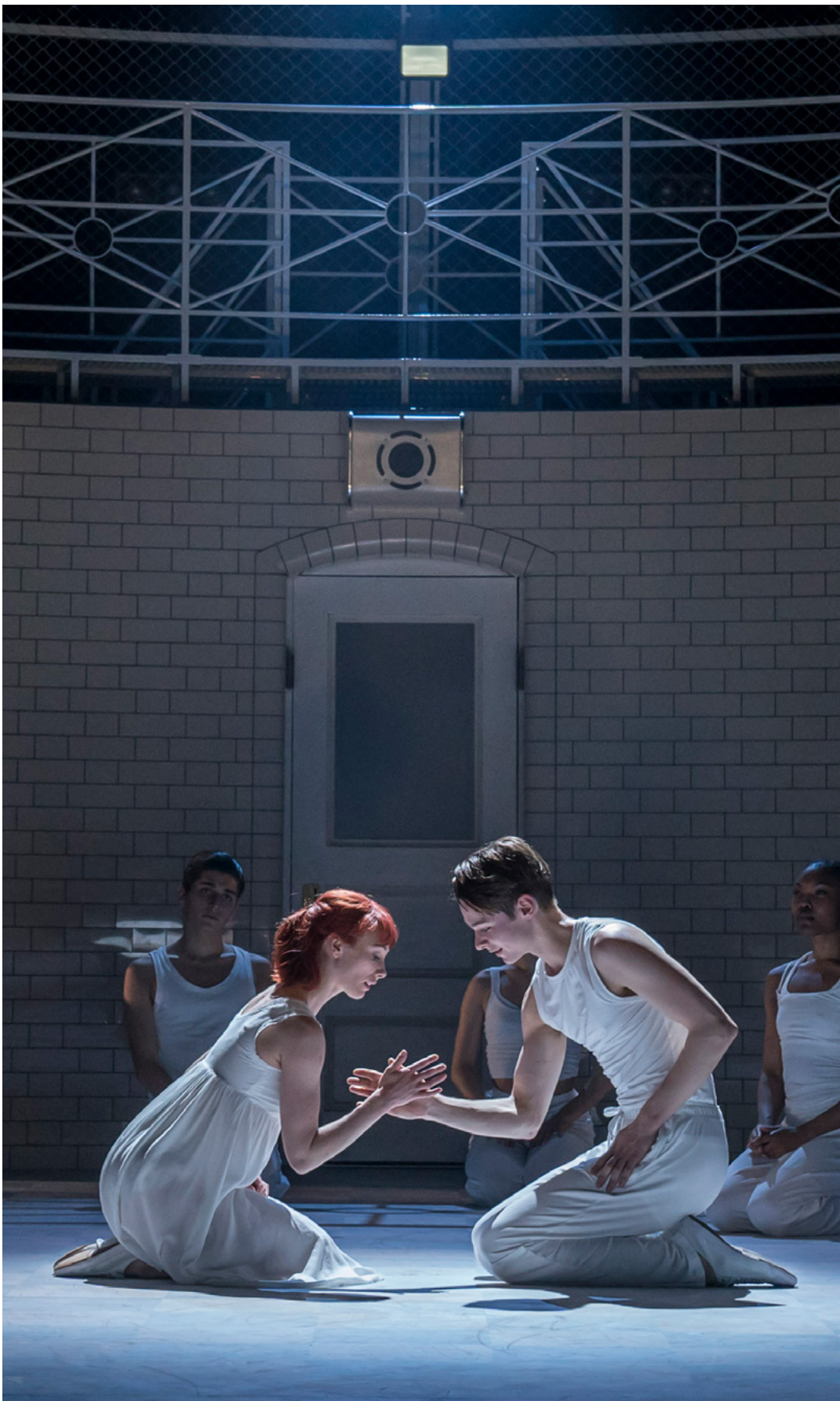
Example of high resolution production photo Matthew Bourne's Romeo & Juliet

Any FOH display stands, pull ups or free-standing items for marketing or for photo opportunities must be agreed by the venue in advance of your visit. They are generally not permitted outside of press events. Visiting companies must send details to marketing@thelowry.com for approval in advance of your arrival. Any non-approved displays will be removed.