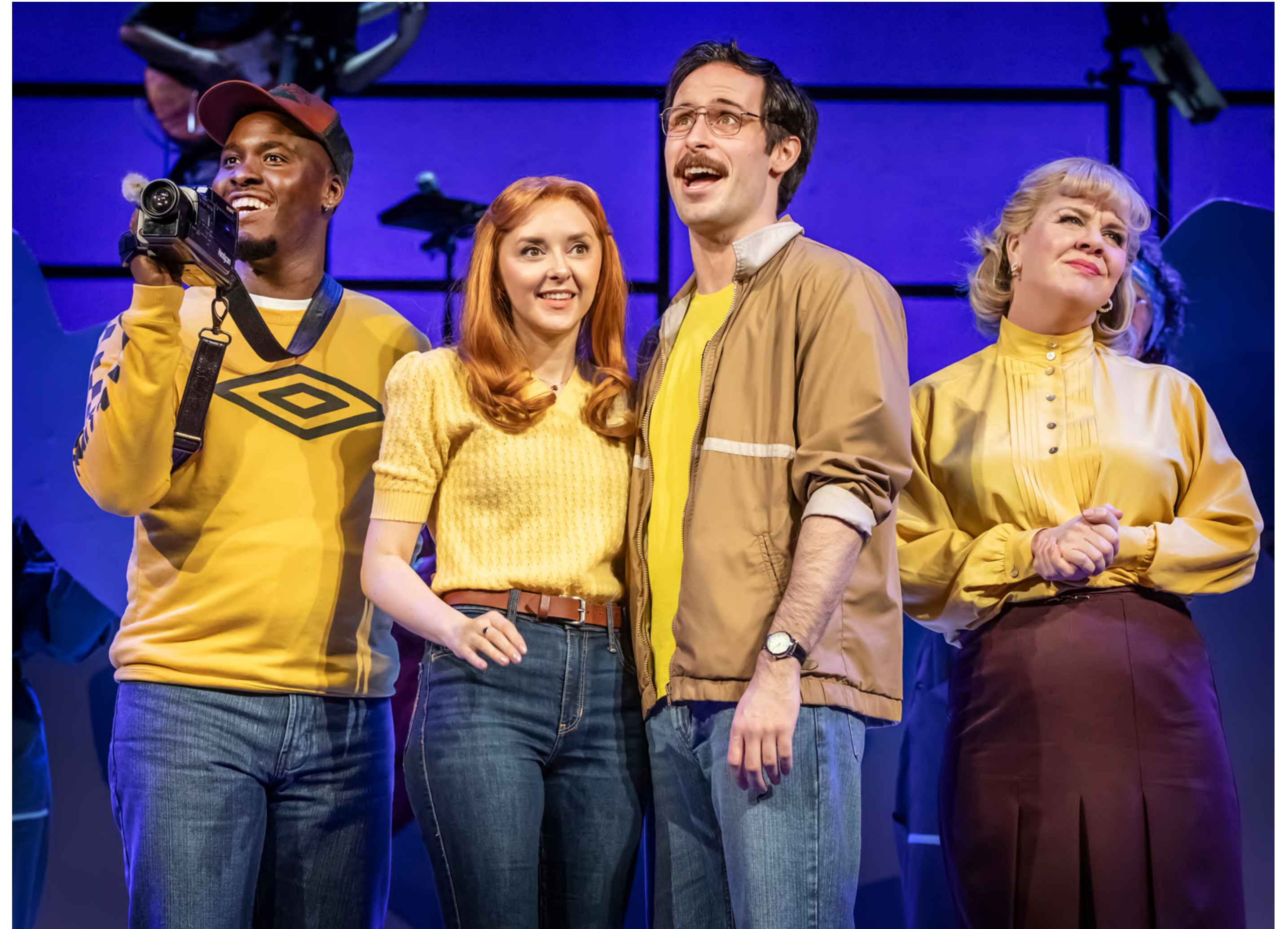
42 Balloons, Lowry (2024)