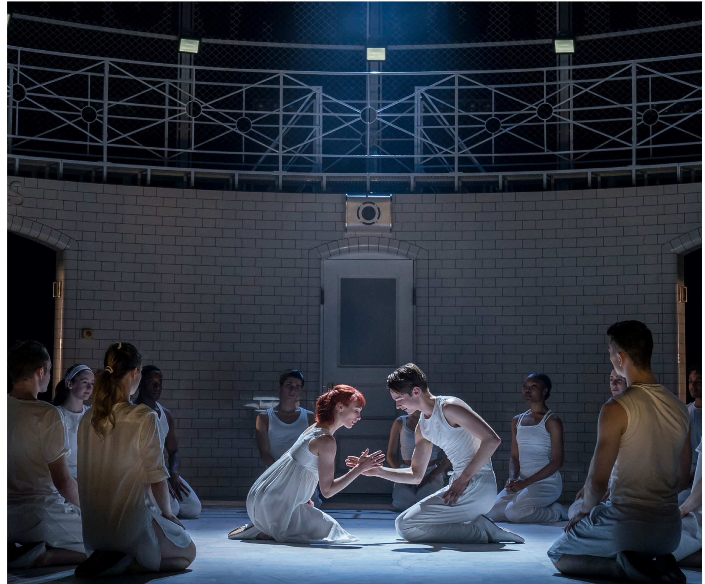
Example of high resolution production photo Matthew Bourne's Romeo & Juliet