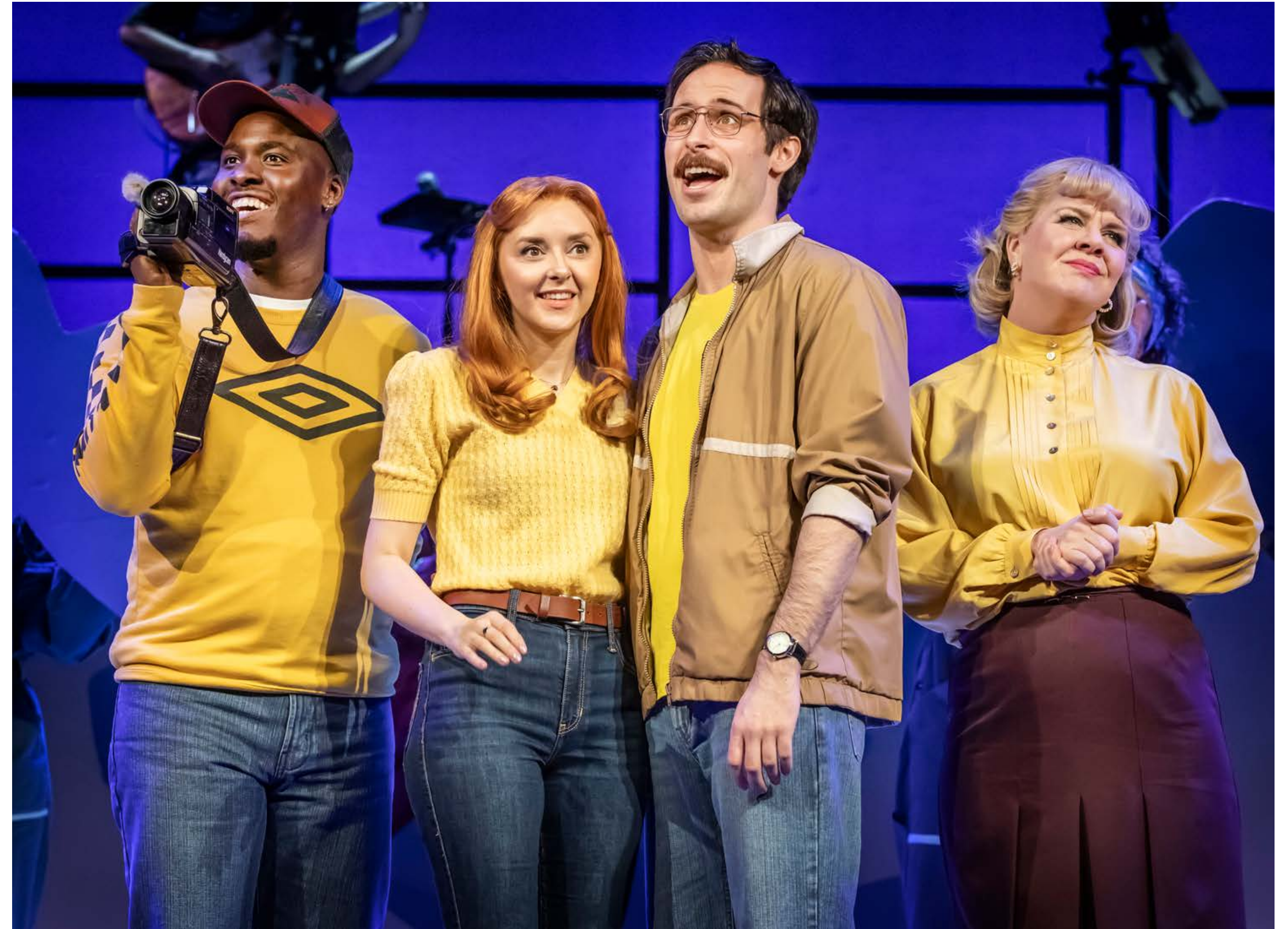
42 Balloons , Lowry (2024)