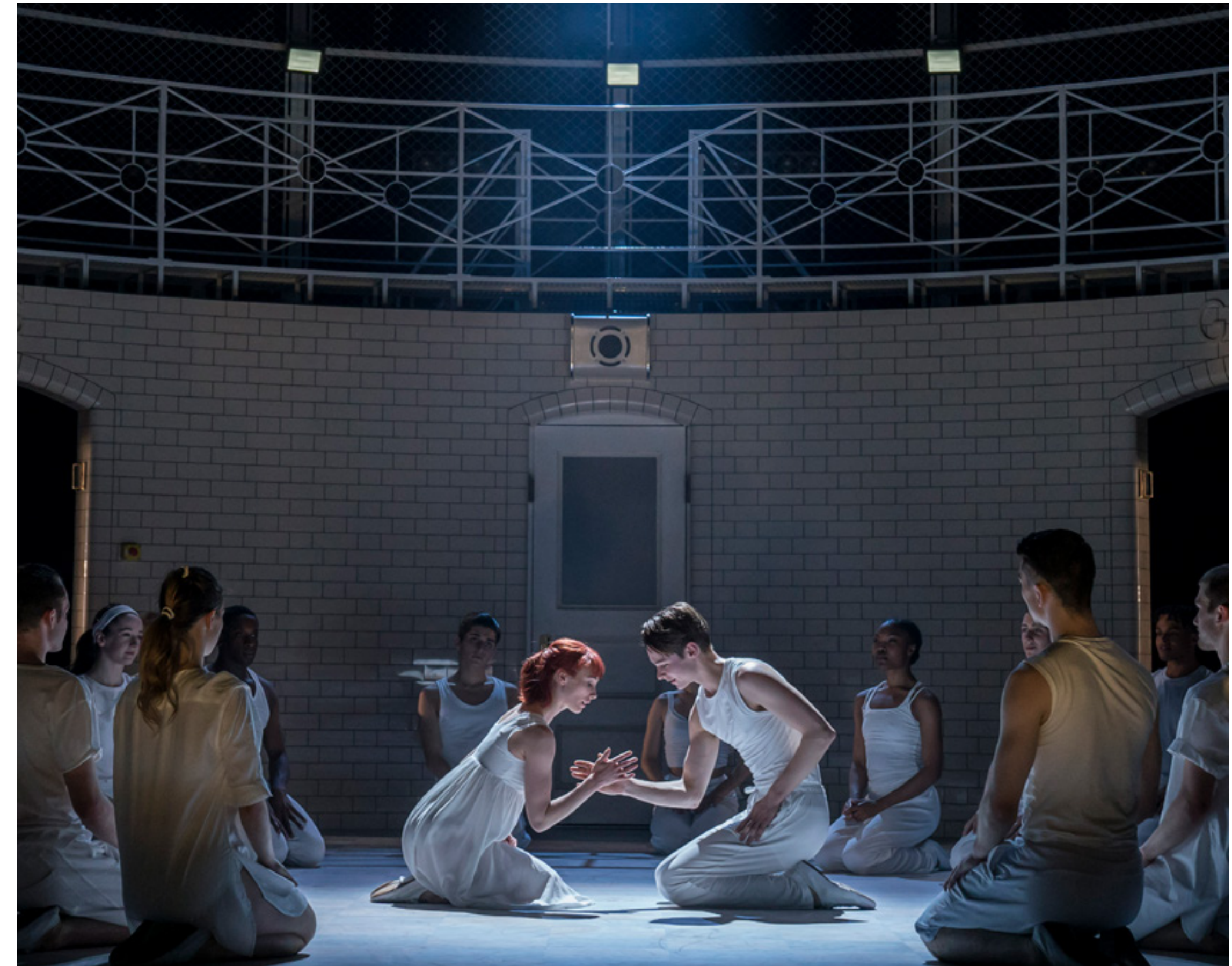
Example of high resolution production photo Matthew Bourne's Romeo & Juliet

Stage Door Lowry Pier 8, The Quays Salford, M50 3AZ